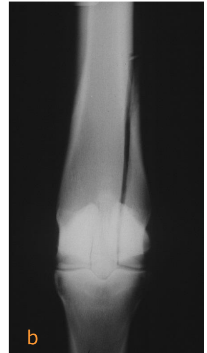
Figures: a & b are both condylar fractures of the cannon bone, the most common fractures in racehorses