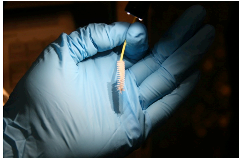
A typical brush used to collect cells for the culture model